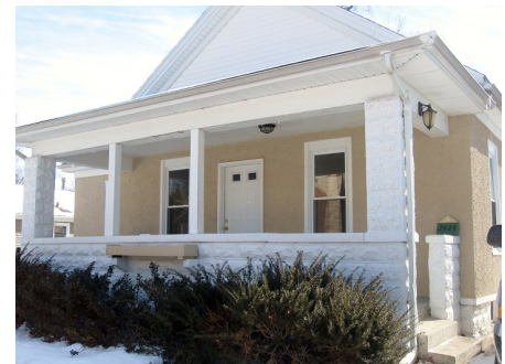
2424 High St.

For more information about the house, call the QAVTC office at 217-224-3775.